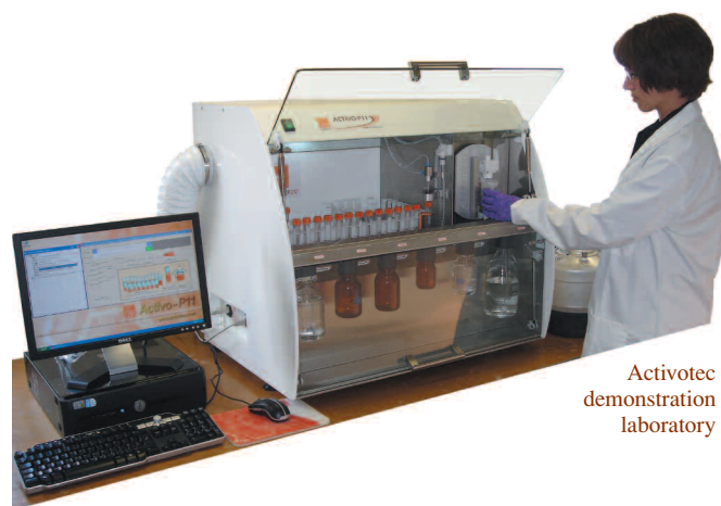
Activotec demonstration laboratory

If you would like further details of the Activo-P11 monitoring system or any of Activotec's range of synthesis instruments or services please contact us below.