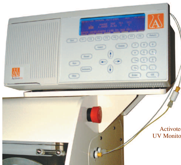
Activotec UV Monitor

The UV monitoring system can be ordered with a new Activo-P11 or existing customers can be upgraded on site.